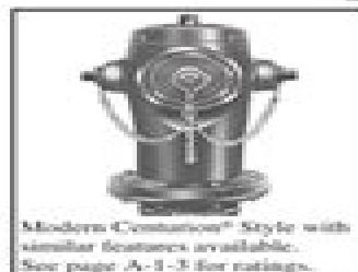
Modern Centurion® Style with similar features available. See page A-1-3 for ratings.