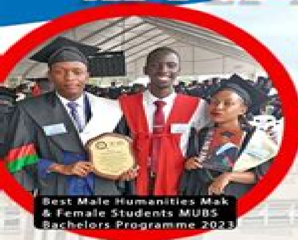
Best Male Humanities Mak & Female Students MUBS Bachelors Programme 2023

AND RECEIVE THE BEST UNIVERSITY EDUCATION NEAR YOU