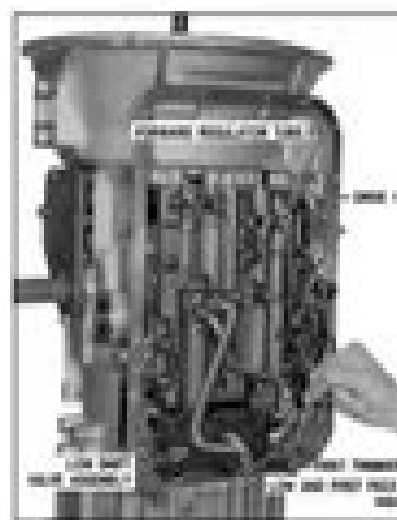
Figure 7-44. Installing External Tubes into Valve Bodies — MT 640, 643 (Earlier Models)