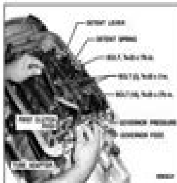
Figure 7-40. Installing Tube Adapter — MT 640 (Later Models)

Later model transmissions do not utilize governor check ball 49.