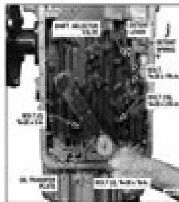
Figure 7-42. Tightening Control Valve Bolts

4. Later Shift Valve Body — MTB 640, 643. Install the separator plate and two shift valves (as assembled in Paragraph 6-5) onto the oil transfer plate (Figure 7-46). Install seven 16-20 x 2 1/4 inch bolts 22 (Older Models) to secure the two shift valves. Do not tighten the bolts at this time.