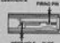
FIRING PIN STOP HOLE SLIDE