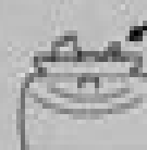
RIGHT SIDE FRAME VIEW