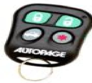
Model: XT-60 RS-650 Plus, RS610 Plus, RS-610, RS650