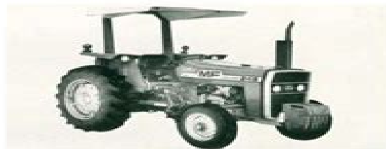
MF 245 TRACTOR