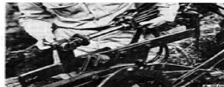
Illustration 93A The lightweight, tubular steel cylinder (2½-inch diameter) is quickly installed on any implement having mounting dimensions conforming to ASAE-SAE standards.

The 2½ x 8-inch hydraulic (push-type) cylinder with hydraulic stop, two 105-inch hoses and a break-away coupling rear half are not included and must be ordered separately if you are not already so supplied.