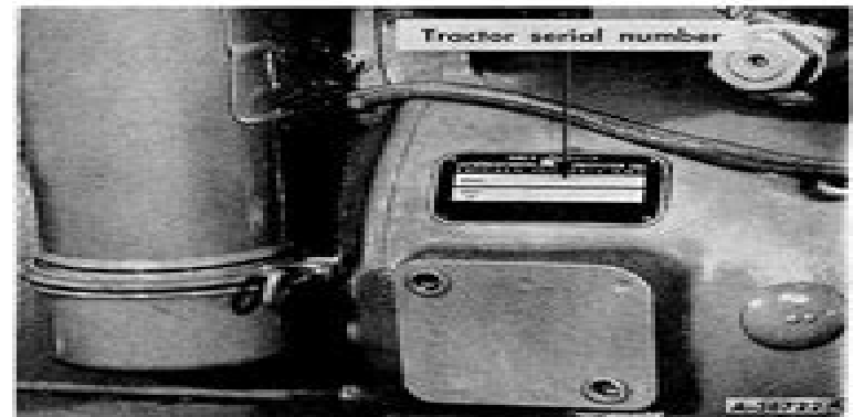
Illust. 3A Location of the tractor serial number.

When in need of parts, always specify the tractor and engine serial numbers including prefix and suffix letters. The tractor serial number is stamped on a name plate attached to the right side of the clutch housing. See Illust. 3A.