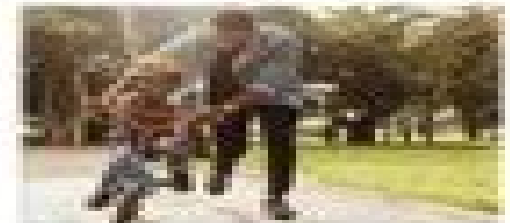
riding a bicycle