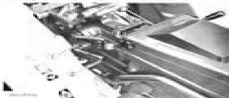
1. Oil 2. Front Wheel Drive Lever

Oil the ball race at the root of the front wheel drive lever.