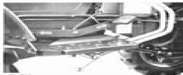
1. Speed Control Pedal Shaft Grease Nipple 2. Brake Pedal Shaft Grease Nipple

Grease the grease nipples on both ends of the brake pedal shaft and the speed control pedal shaft.