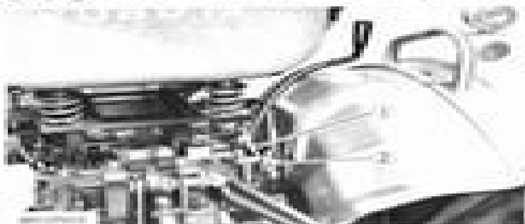
1. Interlock Rod 2. Sliding Holder

Oil or grease the interlock rod and sliding holder.