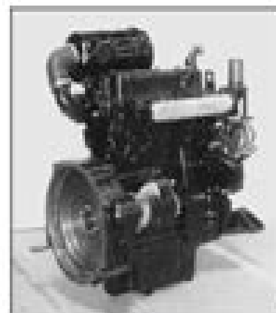
AR1040 INDUSTRIAL ENGINE (View - Exhaust Manifold Side.)