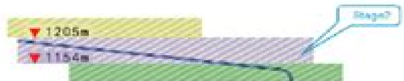
Screenshot from Figure 9