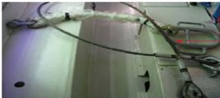
Emergency Recovery Wire

If circumstances do not permit the boat to be recovered by using boat falls. Use Emergency Recovery Wires. Connect wires to boat hooks forward and aft and use crane to recover rescue boat from water.