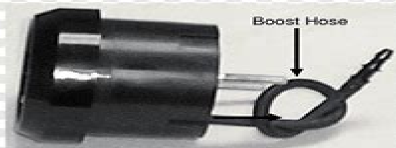
Figure 3. Boost Hose

The boost hose protruding from the back of the gauge is connected to the on-board pressure sensor. See Figure 3. When using the on-board pressure sensor, the boost hose must be connected to manifold pressure. Connect the boost hose to manifold pressure using the supplied tubing and 1/8" NPT barb or an existing manifold pressure port. (NOTE: Do not pull on the boost hose) See Figure 4 for a connection diagram.