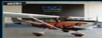
2013 Cessna Turbo 182T 16 TT, XM Weather, Stormscope, Custom Paint, Barnett Jackson Edition - One of a Kind! $499,000