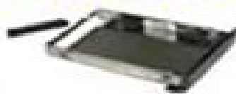
Hard Drive Caddies