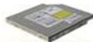
CD-R/DVD/RW Rewritable Drives