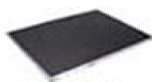
All LCD Displays