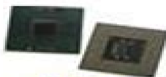
All Processors OR Intel CPU / AMD CPU