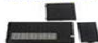
Plastic Doors & Covers