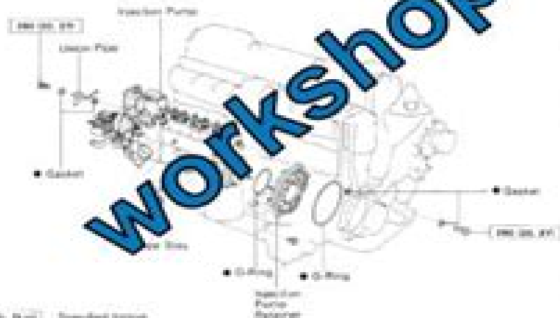
Fig. 25-10, 25-11 Detailed Section ● Non-removable part