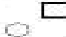
Figure 2. Pedigree symbols.

7. How to identify the inheritance pattern of a trait.