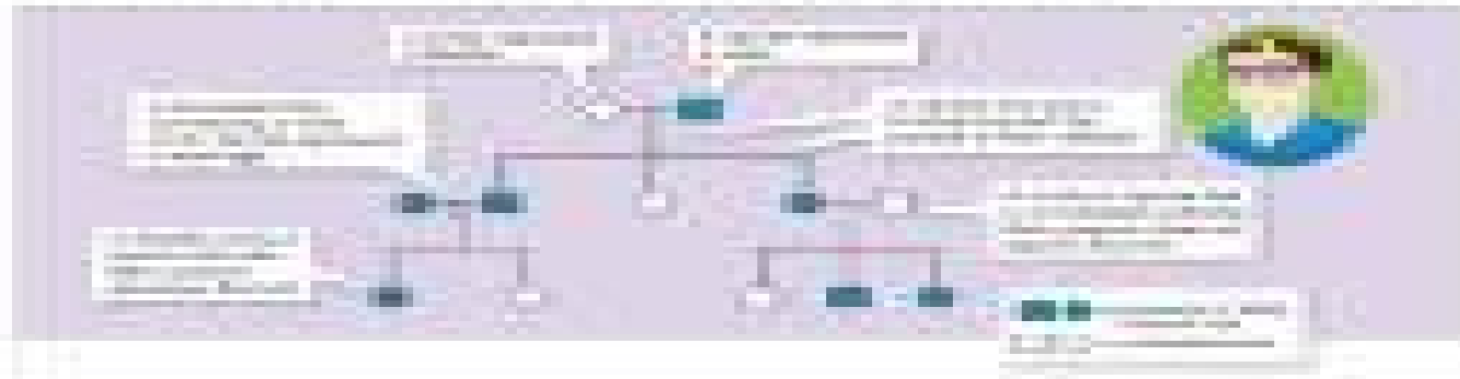
Figure 1. Pedigree chart showing inheritance of a trait.

Genealogical is gathering or viewing a fact that depicts a family history or the transmission of a specific trait. They have been increasingly in vogue and have been important tools in identifying patterns of inheritance of specific traits. Pedigrees can depict relationships between generations, which facilitates a deeper insight to human genetics without which it is not possible to genetically identify disorders in case of basic families. They are also used before testing for autosomal recessive pathogenic variants to identify a carrier's likelihood of having the trait. Below are some examples of pedigree charts.