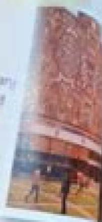
Mosaic Library - Mexico City University