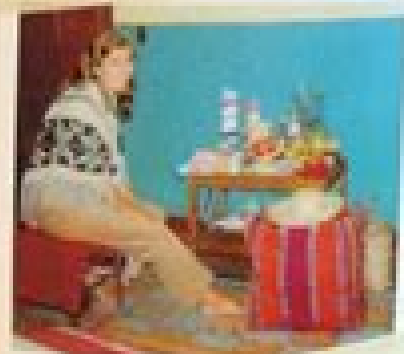
The girl who milk - Costa