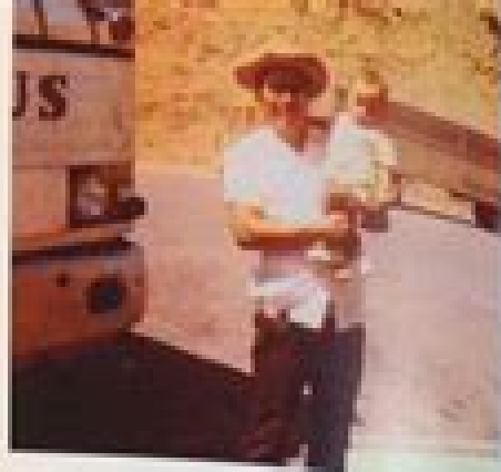
The girl and boy