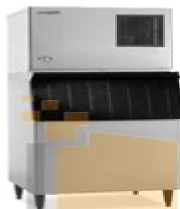
KML-250MAH Cuber Shown on Optional B-500 Bin

KML-250MAH Air-Cooled KML-250MWH Water-Cooled KML-350MAH Air-Cooled KML-350MWH Water-Cooled