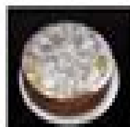
Österreichisch / Tirol (16)