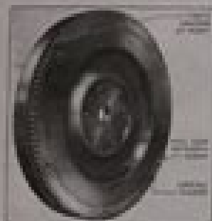
FIG. 4. FLUORIN GLASS AND HYDROGEN FLUORIDE