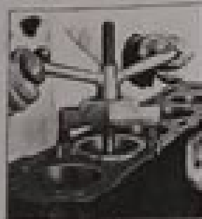
FIG. 5. GRINDING FLUORIN LENS