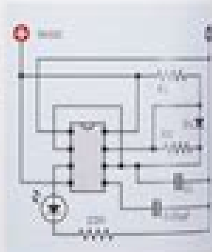
Figure 9-15 In this circuit, a dual potentiometer can be used to adjust the "on" time and the "off" time of the 555 timer and 50% independently of each other with R_1 and R_2 resistors.

In Figure 9-15, a 555 timer has been set up around R_2 . The capacitor now charges only through R_1 , so the timer has a much lower timing constant (than R_2 ). It discharges through R_2 , so the discharge constant is shorter. Consequently, the length of the output pulse can be adjusted with the value R_1 only, while the length of the low output can be adjusted with the value of R_2 only. duration of the high output can be seen by or equals the duration of the low output etc. is not possible with the basic configuration components in Figure 9-13.