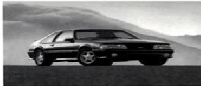
1993 Mustang

Since it was based of the successful Fox Body chassis that includes the Fairmount and the Thunderbird, this allows the 1979-1993 Mustang to share with its older siblings, which is a great benefit to Mustang owners. When the car was new, the sharing allowed Ford to keep the price down, and today gives a bigger choice of parts, but which ones? With Mustang GT Parts Interchange , you will.