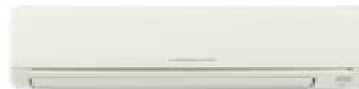
Indoor Unit MSZ-GE18NA