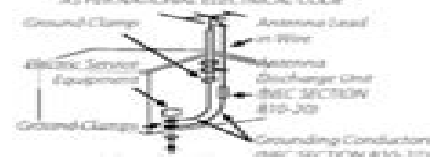
Power Service Grounding Electrode System (BNC AMP 250 (BNC) 10)

Power Lines: An outside antenna system should not be located in the vicinity of overhead power lines or other electric light or power circuits, or where it can fall into such power lines or circuits. When installing an outside antenna system, extreme care should be taken to keep from touching such power lines or circuits as contact with them might be fatal.