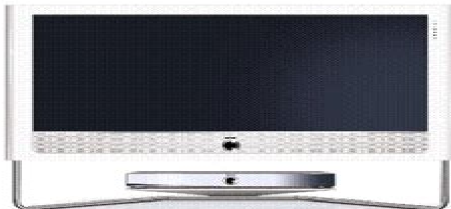
CONNECT 42 MEDIA 67407