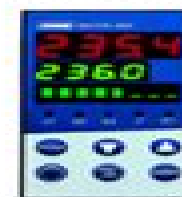
JUMO DICON 400 Type 703575/1...