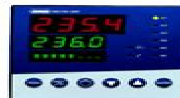
JUMO DICON 500 Type 703570/0...