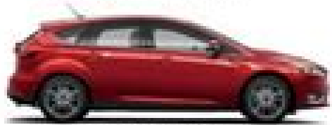
Ruby Red Metallic Tinted Clearcoat