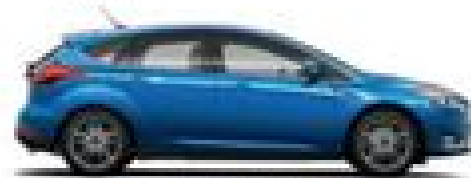
Blue Candy Metallic Tinted Clearcoat