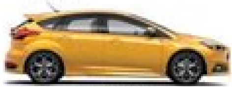
Tangerine Scream Metallic Tri-coat