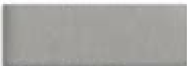
4 Medium Soft Ceramic Leather with Medium Soft Ceramic Inserts