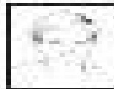
Portrait of a man