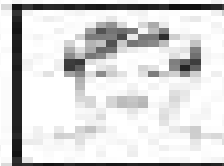
Portrait of a man