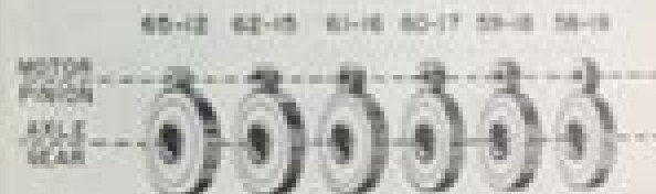
Gear Ratio Chart Fig. 1-5

During acceleration, the traction motor electrical hookup is changed to utilize the full power developed by the main generator, within the range of its current and voltage limits. The changes in the traction motor electrical connections is called transition. Four steps of transition are used on the GP9 as follows: