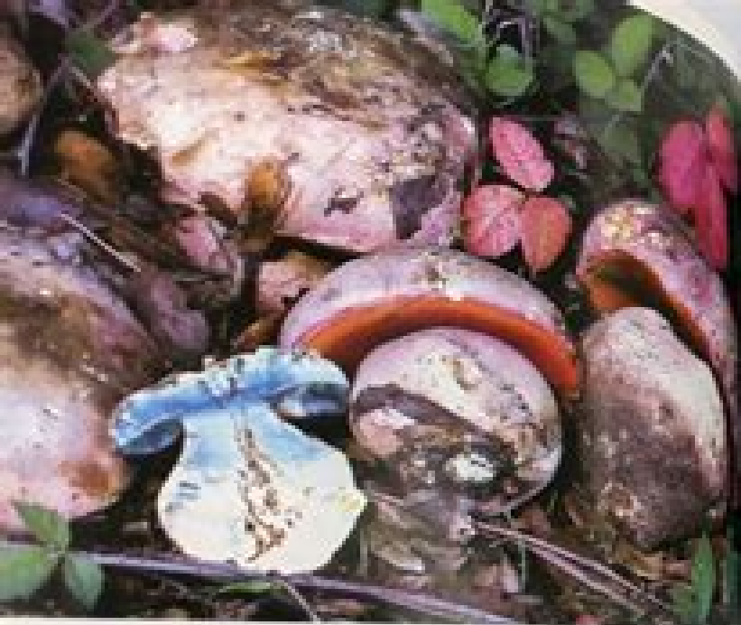
137. Boletus satanas (Satan's Bolete), p. 525, a poisonous and bitter mushroom