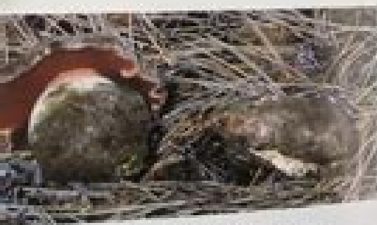
138. Boletus haemuliformis (see comments under B. pulcherrimus , p. 528).