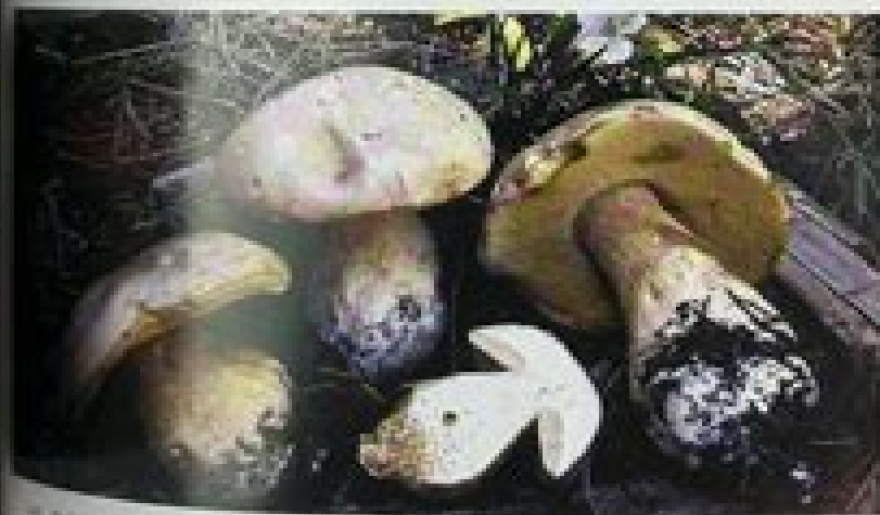
141. Boletus leucon (White King Bolete), p. 529