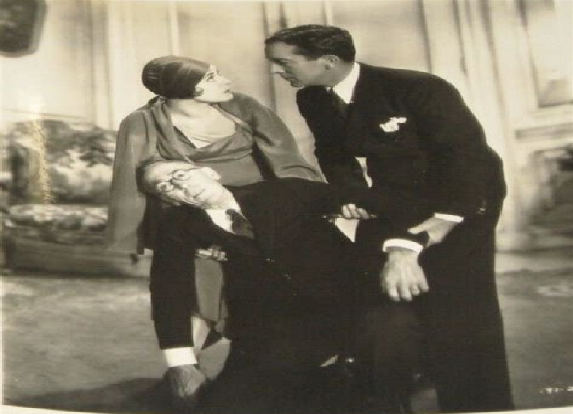
© "MURDER WILL OUT" A First National Vitaphone Picture ©