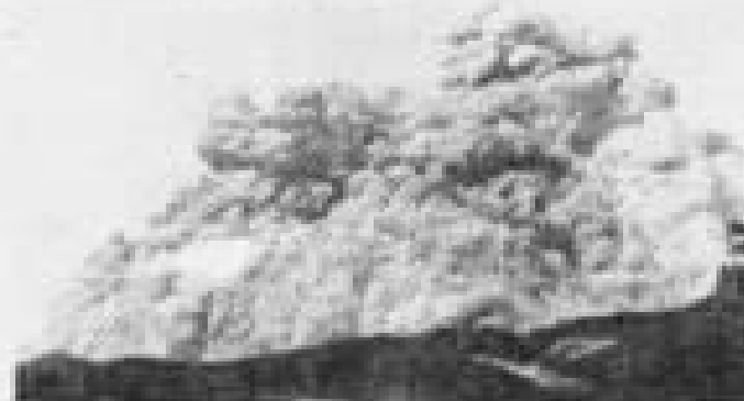
© 2000 Blackwell Science Ltd Journal of Internal Medicine 247: 399–406

Yarn-Hodgepodge and Bernadette: Chances were in the right place at the right time, and these kids got their slice of fame & trust speculation and dramatics involved on TV. It was a phenomenon... a wave of luck.