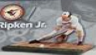
Cal Ripken Jr.