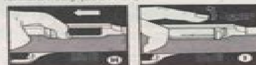
Pull charging handle all the way back.

With the safety on SAFE and the loaded magazine locked in place, the rifle in normal shooting position, and pointed in a safe direction, pull the charging handle all the way back and let it snap forward freely (See H & I).