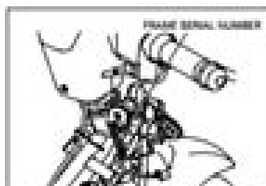
FRAME NUMBER The frame serial number is stamped on the right side of the steering head.