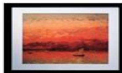
Mini-Split ARTCOOL™ Indoor Unit Customizable Art Panel