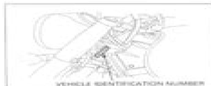
VEHICLE IDENTIFICATION NUMBER

The vehicle identification number (VIN) is attached on the left side of the steering head.