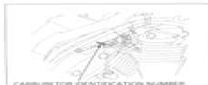
CARBURETOR IDENTIFICATION NUMBER

The engine serial number is stamped on the right crankcase below the rear cylinder.