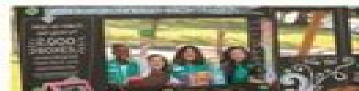
Learning Financial Literacy Skills

Girl Scouting builds girls of courage, confidence, and character, who make the world a better place.