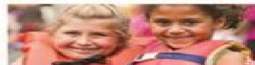
Developing Lifelong Friends

Girl Scouts of the Commonwealth of Virginia Offers Programming to Girls in K-12th Grade.