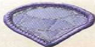
AMETHYST (7-9 Years)