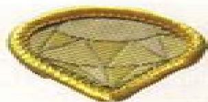
TOPAZ (5-7 Years)