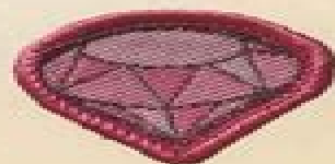
AGATE (9-12 Years)