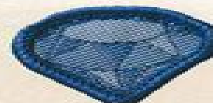
SAPPHIRE (12-14 Years)