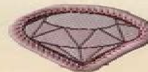
DIAMOND (12-14 Years)