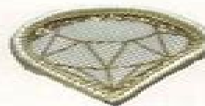
ZIRCON (9-12 Years)