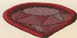
GARNET (7-9 Years)