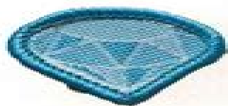
TURQUOISE (5-7 Years)