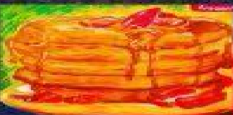
Art by Shalla the Artist, Hot Pancakes, 2013, acrylic on canvas, 50 in. x 8 in., Nevada.