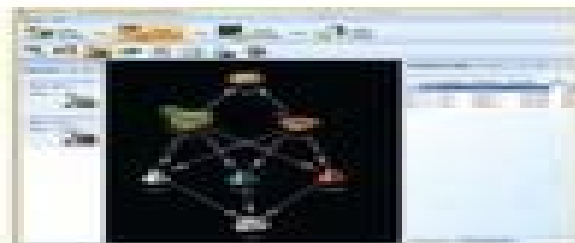
Разработка очередности работ на основе данных о выработках и производственных планах работ.