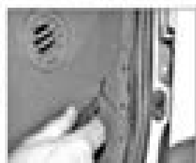
11.52 Using a small screwdriver, remove the bolt covers from the face on both sides