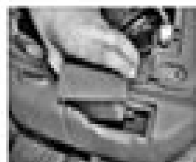
11.44 Remove the wiring

25 Ensure that the cylinder head mounting flanges are in place in the cylinder block, then fit the new cylinder head gasket over the dowels (see illustration). The gasket can only be fitted one way, with the bolt to determine the gasket thickness at the front (see illustration 11.43). Then use to avoid damaging the gasket's rubber coating.