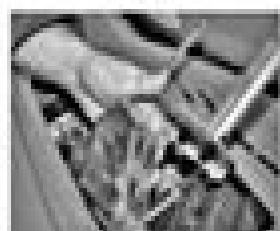
11.48b ... then remove the bracket

26 Working through the storage tray (specify only the four bolts securing the brackets and mounting bracket in the face (see illustration).