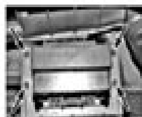
11.47 Insert the four bolts (pinwards) securing the head to the mounting bracket in the block