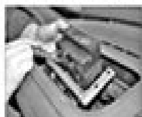
11.48a Remove the retaining clip and screw the head into the block and the conditioned edge flange from the mounting bracket