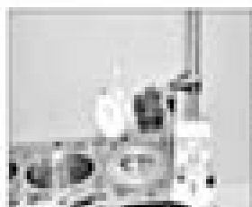
11.42 Using a feeler gauge to measure the piston pin clearance