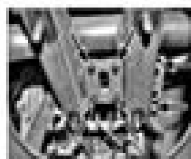
11.50 Under the air ducts (pinwards) securing the face to the mounting bracket in the headwork