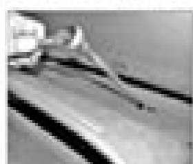
11.49b ... and remove the face upper retaining bolts

33 Under the face outer mounting bolts from the face on both sides (see illustration).