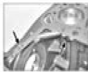
11.41 Push pin holes in the piston (pinwards), which indicate the piston's position