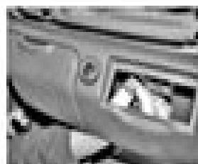
11.45 ... and disconnect the wiring connector from the opposite lighter