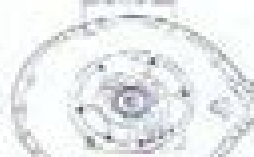
Chrysler TH-727, 341, 383, 400, 474, 440