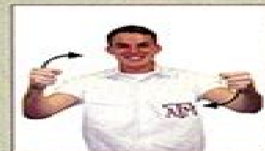
Sit Down Bus Driver Driving motion