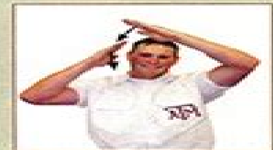
Team Hands form "T"