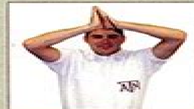
Horse Laugh Hands together Motion forward and backward