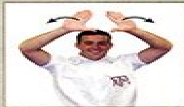
Aggies Hands form "A"