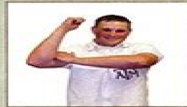
Beat the Hell Arm folds over hand at elbow