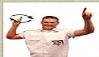
Old Army Finger makes "C" motion