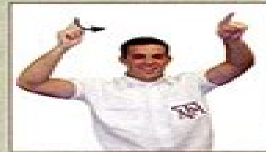
Aggie War Hymn Right hand turns quickly