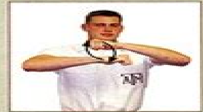
Farmers Fight Hands rotate