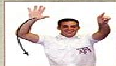
Locomotive Hand grips as lowered (pulling train whistle)