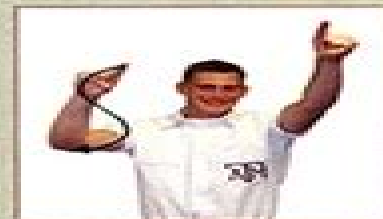
The Spirit of AggieLand Finger draws "S"