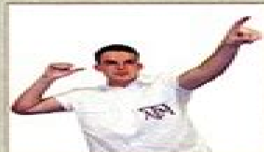
Gig 'Em Thumb extended waving motion