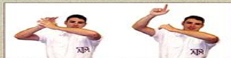
Skyrocket Hands clap, point to sky