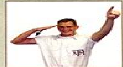
Military Saluting motion