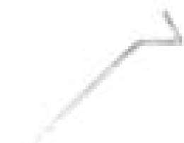
This foot is to align on the machine