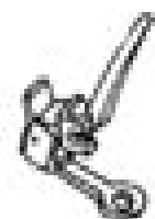
Stitching Foot (extra) (optional)