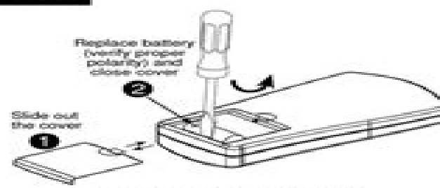
Figure 3 - Battery Replacement