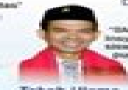
Tokoh Ulama Ust. Abdul Somad

"SMA N 2 Sumbar satu-satunya sekolah yg saya temui menerima anak didik secara adil merata. Menghasilkan putra-putri yang berprestasi, telah lalu ketika di antarakan oleh orang tua, saya pergi mengaji ke surau. Disarankan kepada guru secara adil"