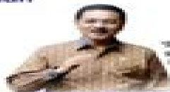
MENDAGRI Periode 2009-2014 Dr.H. Gamawan Fauzi, SH, M.M.

"PILIHAN SMA N 2 SUMBAR sebagai tempat belajar, merupakan jalan menuju ke arah berprestasi"