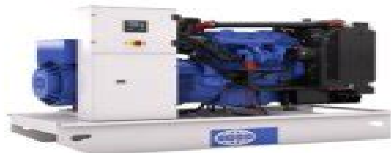
Imagen con finalidad ilustrativa únicamente